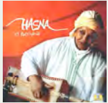
"DJAZAIR JOHARA" 2001 Label Bleu/ Indigo